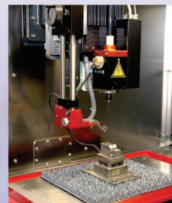
PG-S-M manual height adjustable guide holder

The integrated retractable device leaves the quick access for the operator of the working area and the work piece under the guide holder.