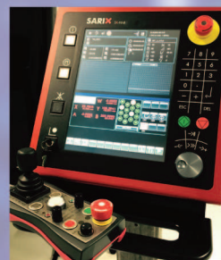
SX-HMI 12" Touchscreen control unit with joystick command handbox

Maintenance control and machine status are displayed on several part windows. Log-file and part program machining log are on direct access by Ethernet or USB port.